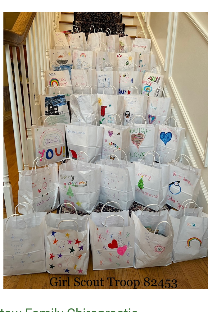
Girl Scout Troop 82453

There's more than one way to donate, and these wonderful people and organizations have figured that out. Some ran food drives, some made masks for our guests, and one even asked for donations in lieu of birthday gifts. But no matter HOW they gave, they all gave of themselves to continue to feed their neighbors and friends. Here's who we're thanking this month so far: